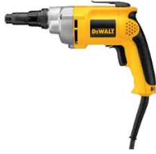
Corded Versa-Clutch™ Screwguns DW267, DW268 & DW269