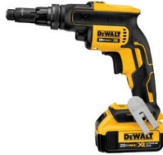
Cordless Versa-Clutch™ Screwgun DCF622